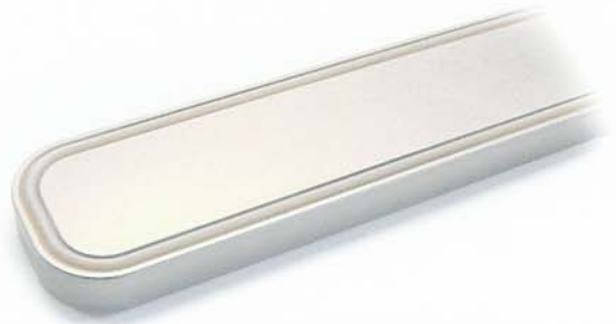
Bonded & Non-Bonded Type