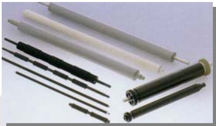
< Plastics Rollers for OA equipments >